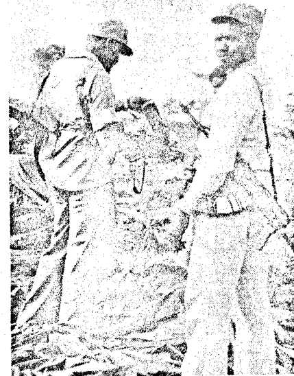
PATRIOTIC FRONT GUERRILLAS

Picketline: 12 Noon at the Newsweek Building 444 Madison Ave (50th St.)