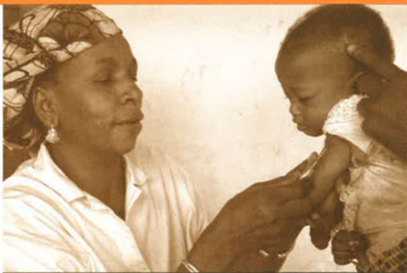
Above: African health professionals are struggling to save lives, but foreign creditors have forced African governments to cut spending on health.

Of the 3 million AIDS deaths worldwide in 2000, almost 2.5 million were in Africa. Life-prolonging drugs have cut AIDS deaths in rich countries, but neither these treatments nor other resources to combat HIV/AIDS are available to the vast majority of people in Africa. The spread of the pandemic and the world's failure to