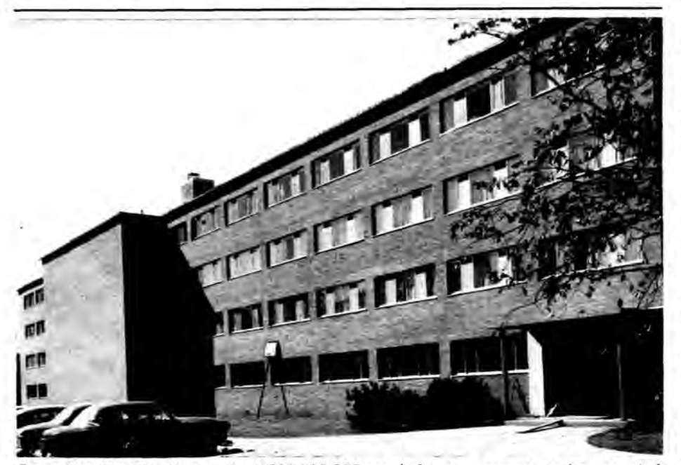
Butterfield Hall is first unit of $13,500,000 men's housing project to be occupied.

With the campus air charged with high expectancy for an exciting year of campus activities, M.S.C. has taken on its full bloom of college color, youth and hopefulness.