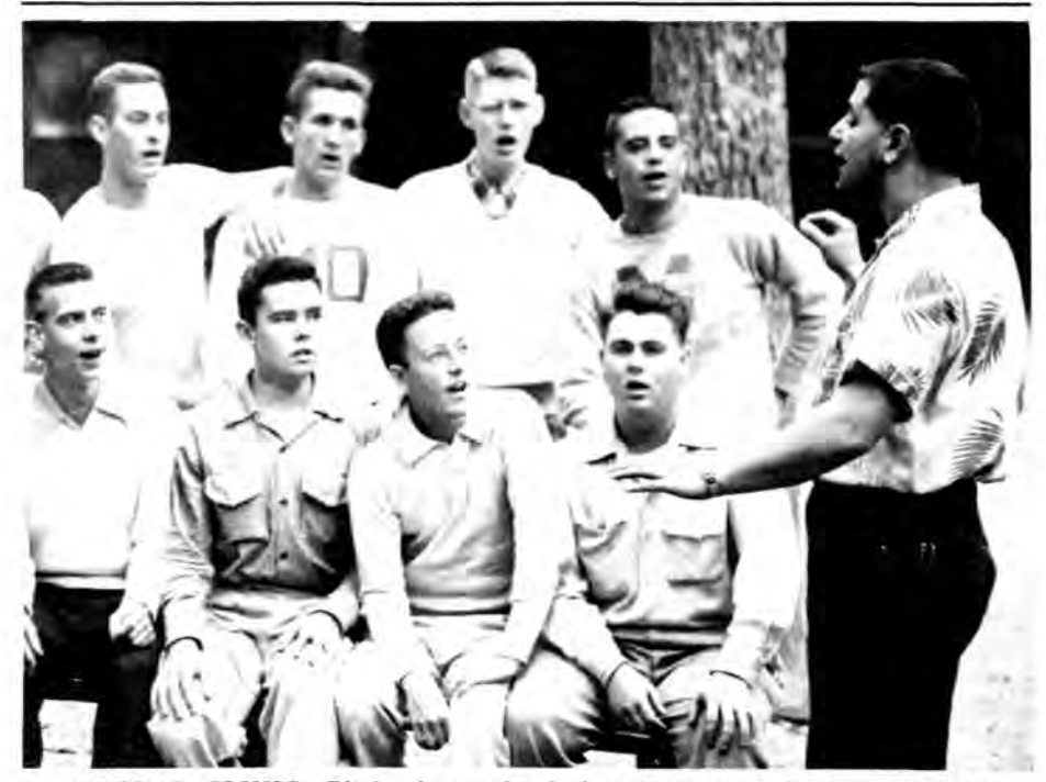
CHORAL CLINIC: Pitch pipes echoed through Yankee Springs recreation area in September as the 60-voice M.S.C. men's glee club went through a weeklong practice session. The equivalent of two terms rehearsals, the clinic prepared the group for extensive concert tours this fall and winter.