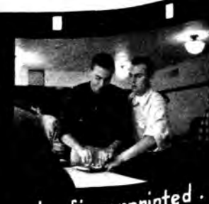
Is fingerprinted . .