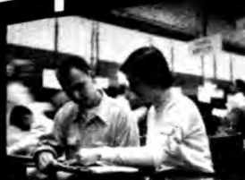
Receives assistance . .