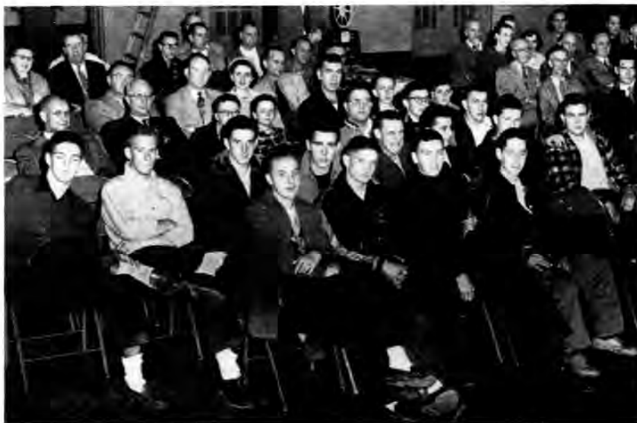
HONOR LOCAL GRID STARS: More than 190 persons attended the annual football meeting of the Alpena Alumni Club which honored local high school football stars and their coaches. Proceeds from the event went to the club's scholarship fund which is to be used to sponsor M.S.C. scholarships for talented Alpena high school students.

Branch County alumni held their annual fall meeting at the Unity Grange