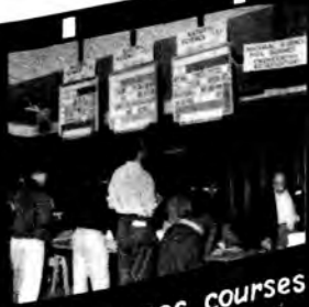
Arranges courses . .