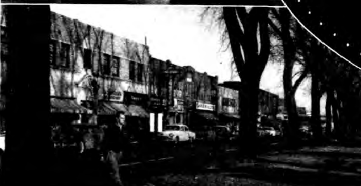
Gets influenza shots . .