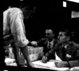
Reserves class periods . .