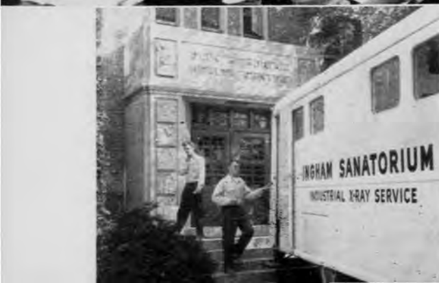
MEDICAL EXAMINATION AND X-RAYS