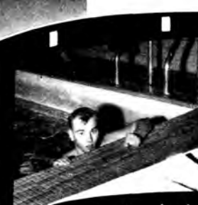
Takes swimming tests . . .