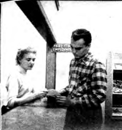
SIGNING UP FOR PART-TIME EMPLOYMENT