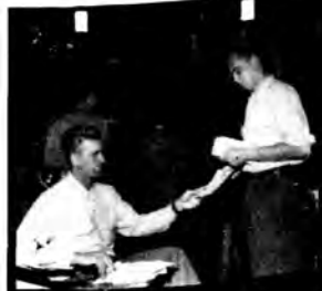
Receives registration guide . .