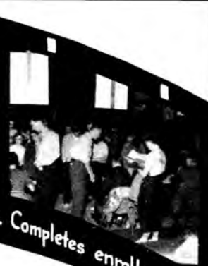
Completes enrollment . .