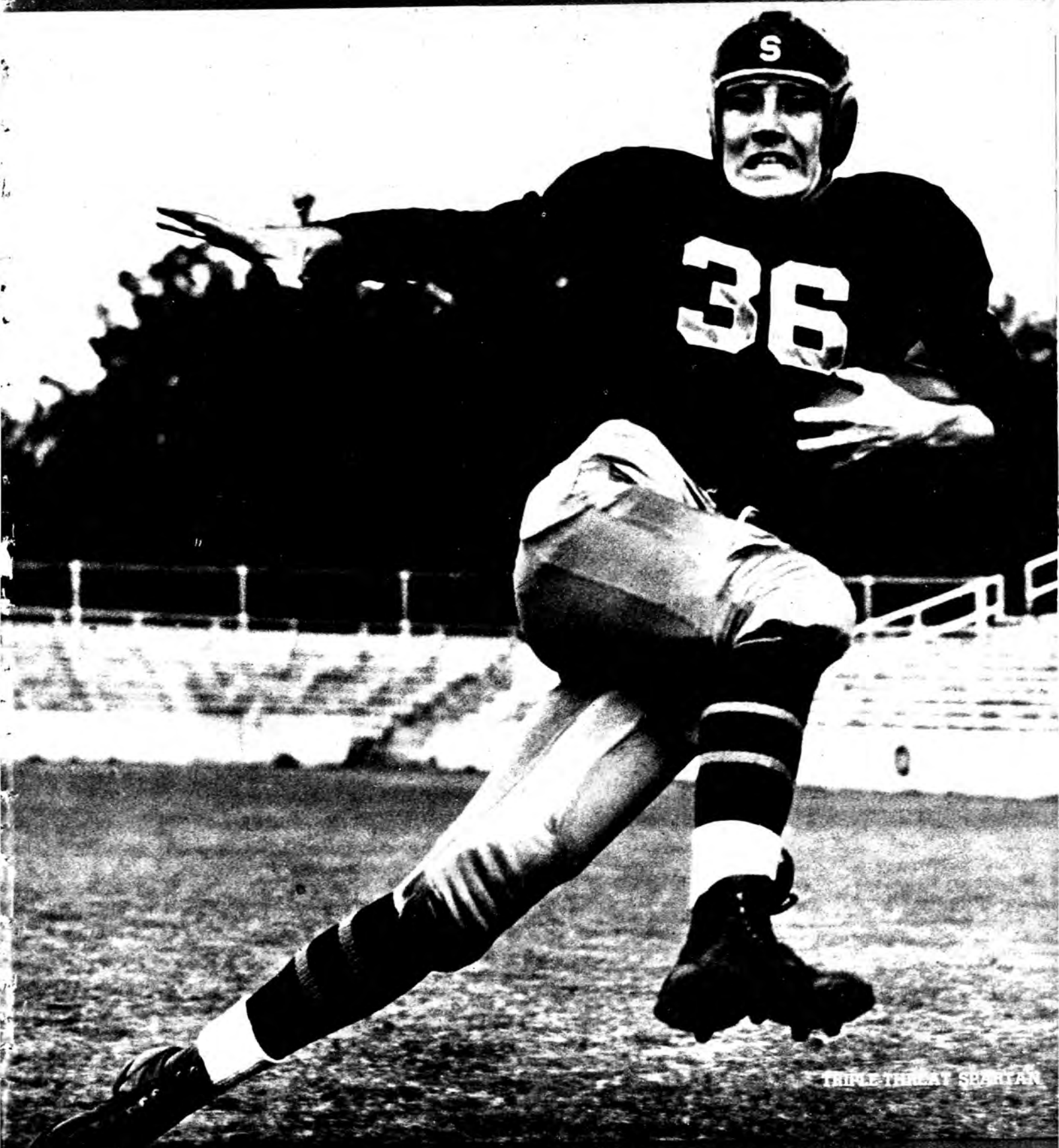
TRIPLE THREAT SEAGYAN

Michigan State College , EAST LANSING . . . September, 1945