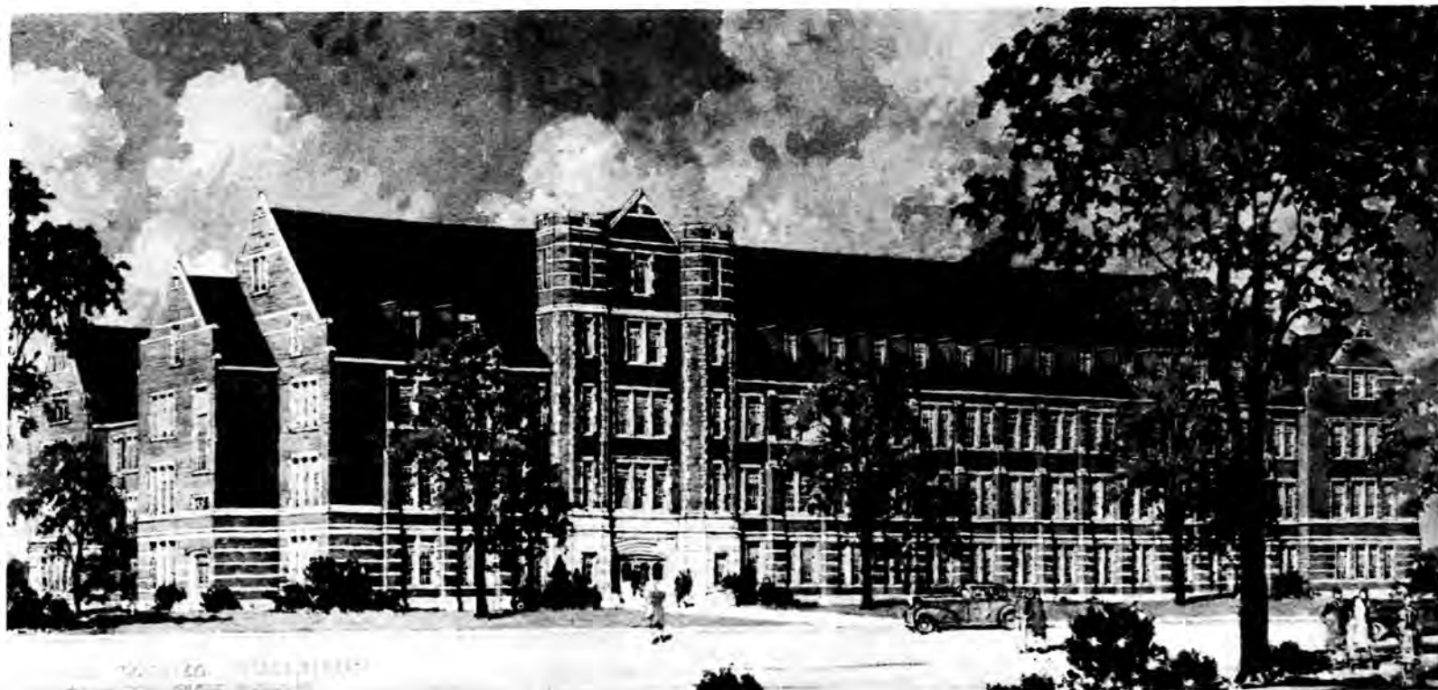
Proposed New Classroom Building for M.S.C.