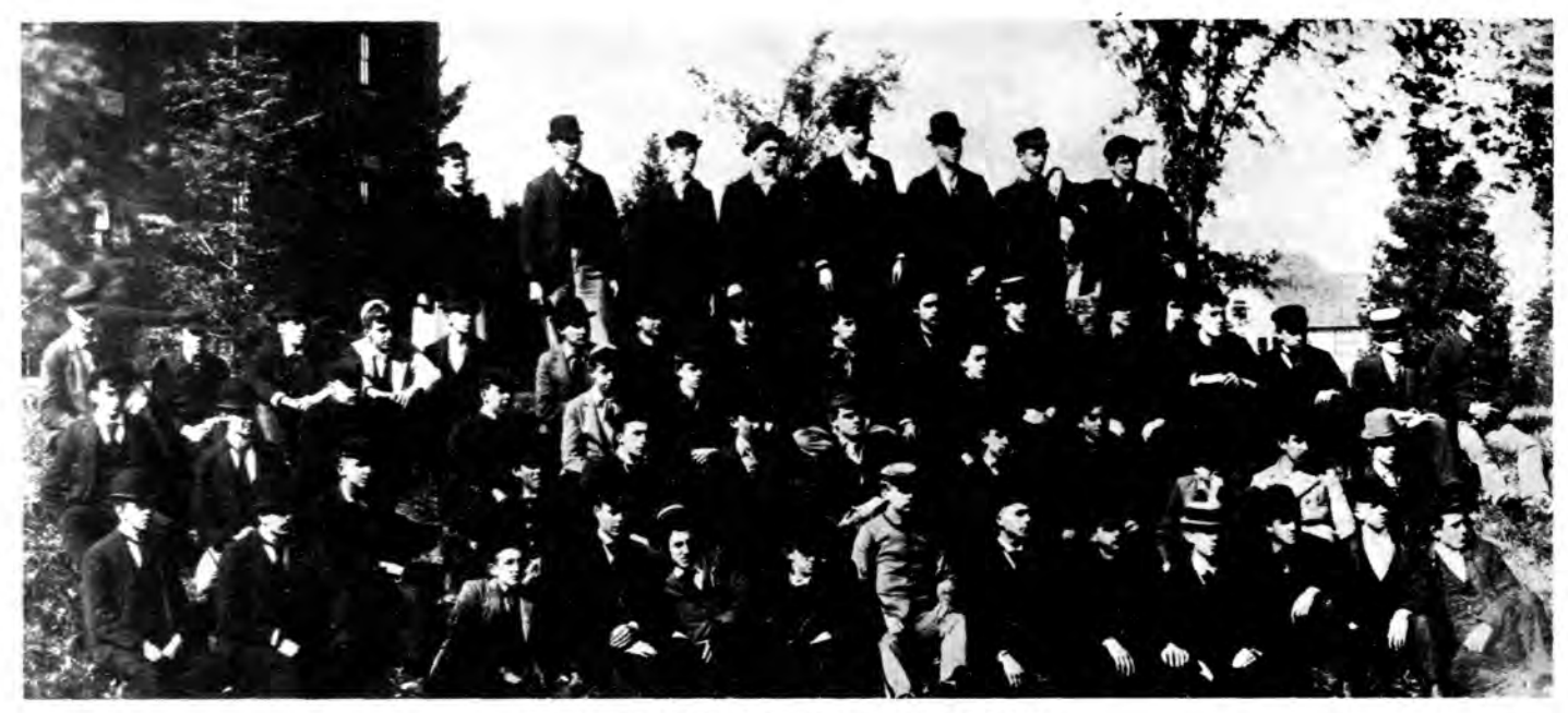
The class of 1895 as Freshmen in the spring of 1892.