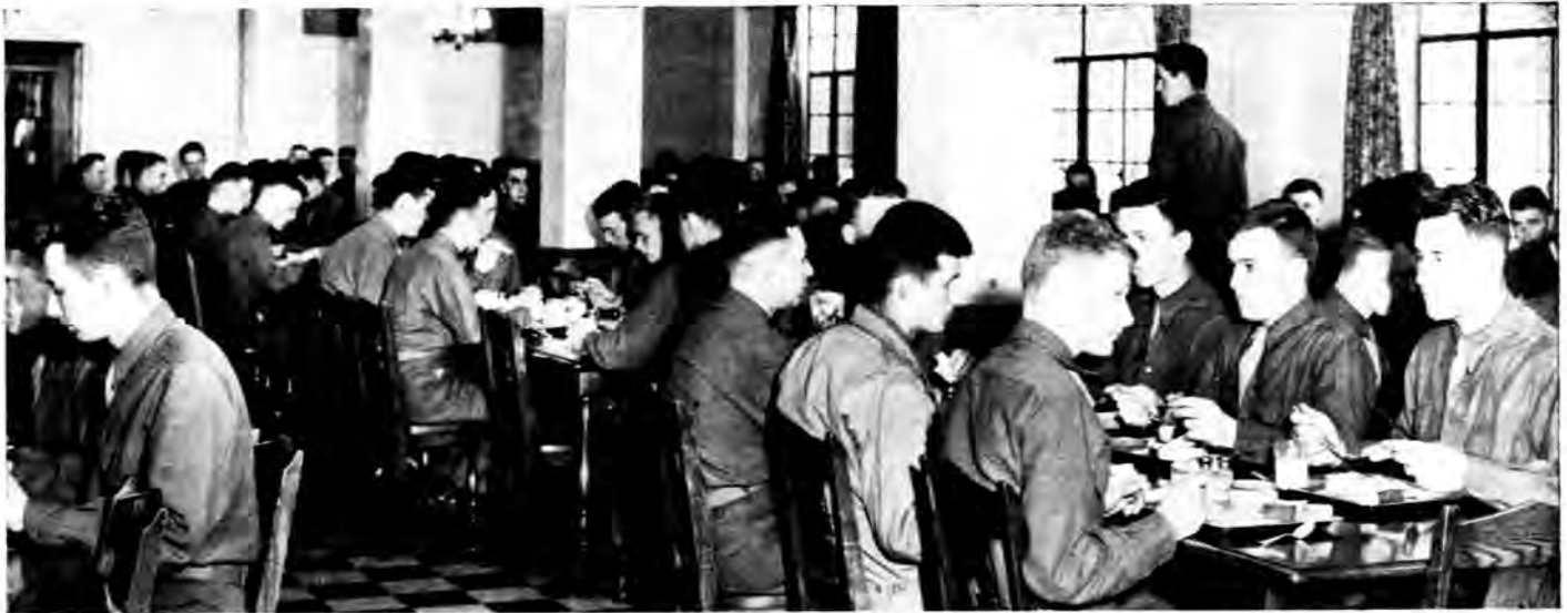
It's the Army's Dining Hall Now

And the above picture is proof. Other evidence that the army has taken complete possession of Mason-Abbot hall is the sign, "Restricted Military Area," which appears in a half dozen places around the huge living quarters.