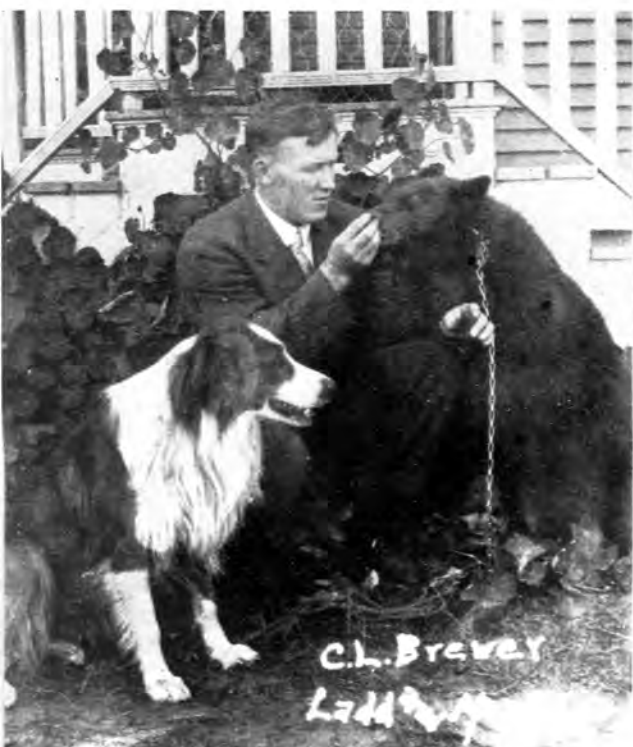
↑ He was in charge of all college athletics in 1909. "Monty" came from Montana to act as the M.S.C. football mascot. Later he was sent to a zoo.