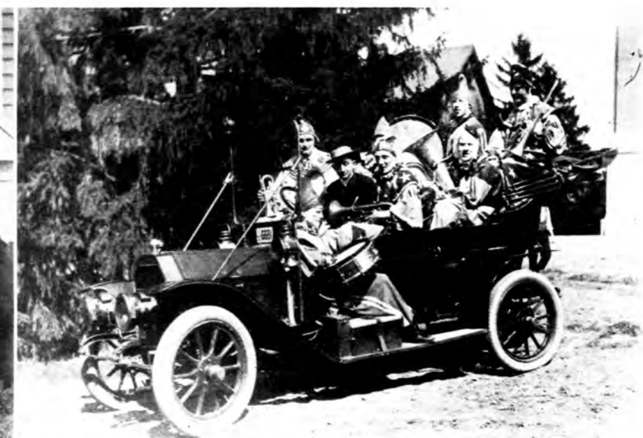
Co-eds during the spring term, 1911. The picture was taken in front of the Women's building, now Morrill hall, the home of the Liberal Arts division.