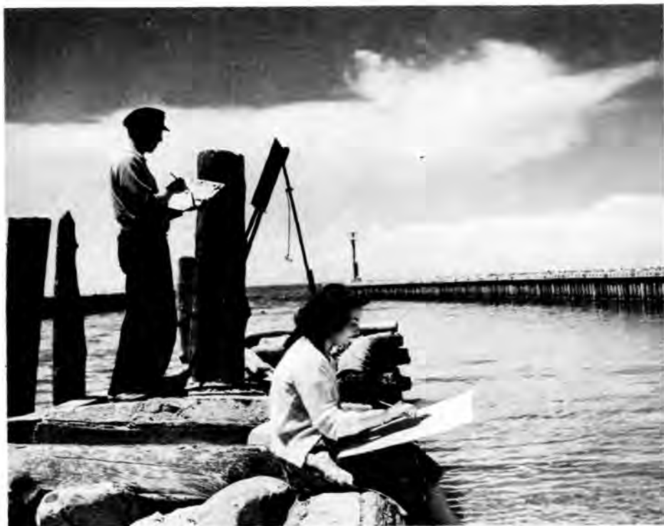
Art Camp at Leland