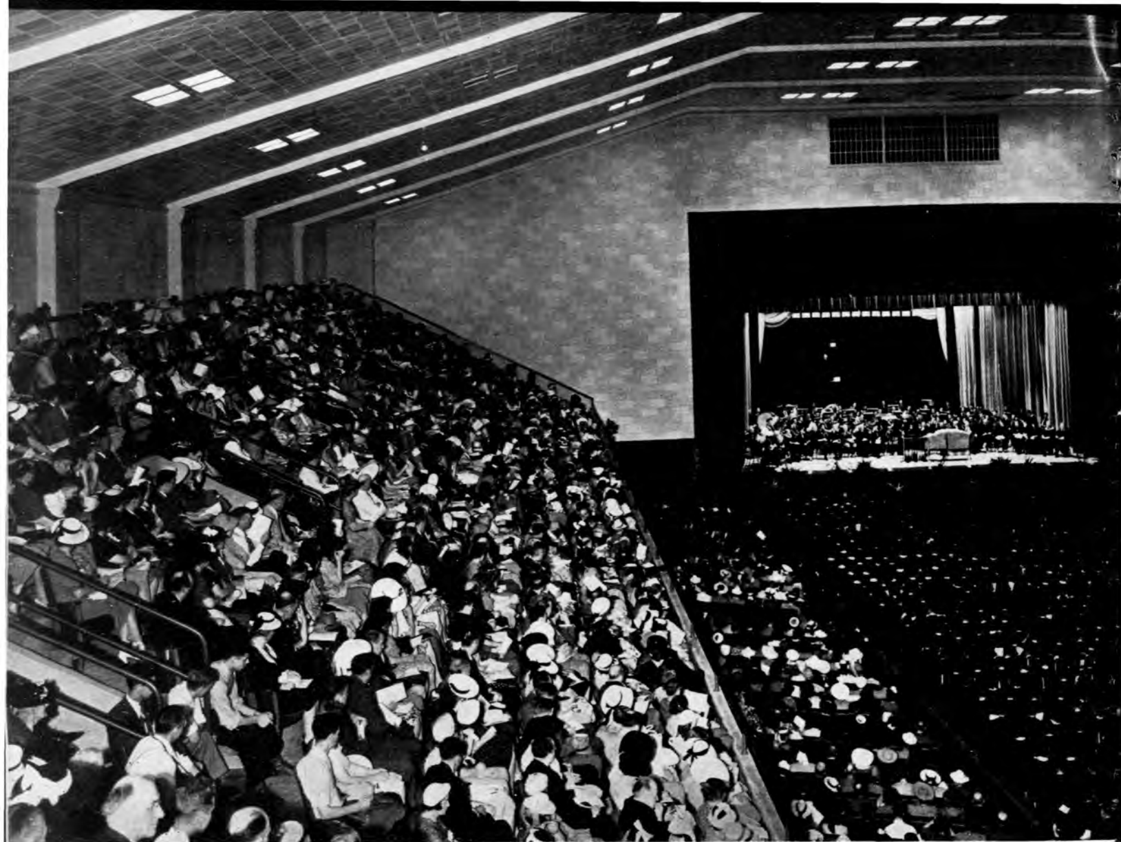
Including students completing requirements for graduation at the end of summer session, this year's graduating class numbers approximately 1,121. This represents the largest number of degrees ever granted by Michigan State. Behind the audience, the stage is set for commencement exercises in the new auditorium.