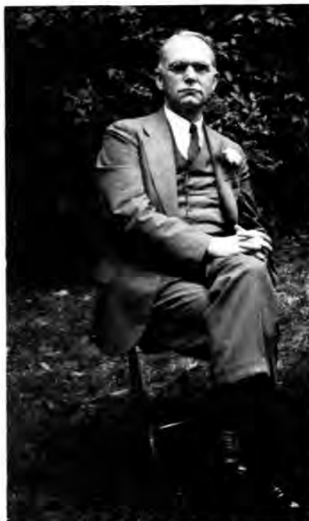
Ray Stannard Baker, '89

W INNER of the 1939 Pulitzer prize for the authorized biography of Woodrow Wilson: Life and Letters , Ray Stannard Baker, '89, represents one of Michigan State college's most distinguished graduates.