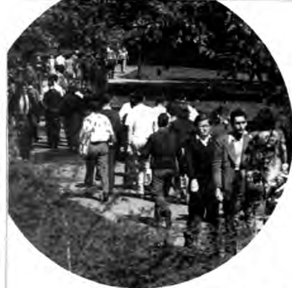
"Class Time" along the Red Cedar. Now these students have scattered in all directions—some gainfully employed . . . others attending summer school . . . a few doing the odd jobs around home.