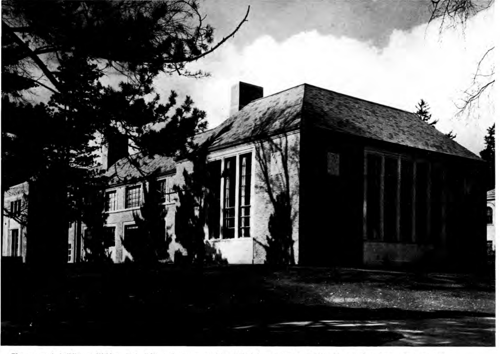
The new music building at Michigan State College, above, was officially dedicated on December 3, 1939. The old Gym Annex was torn down to make room for the first new Liberal Arts building on the campus.