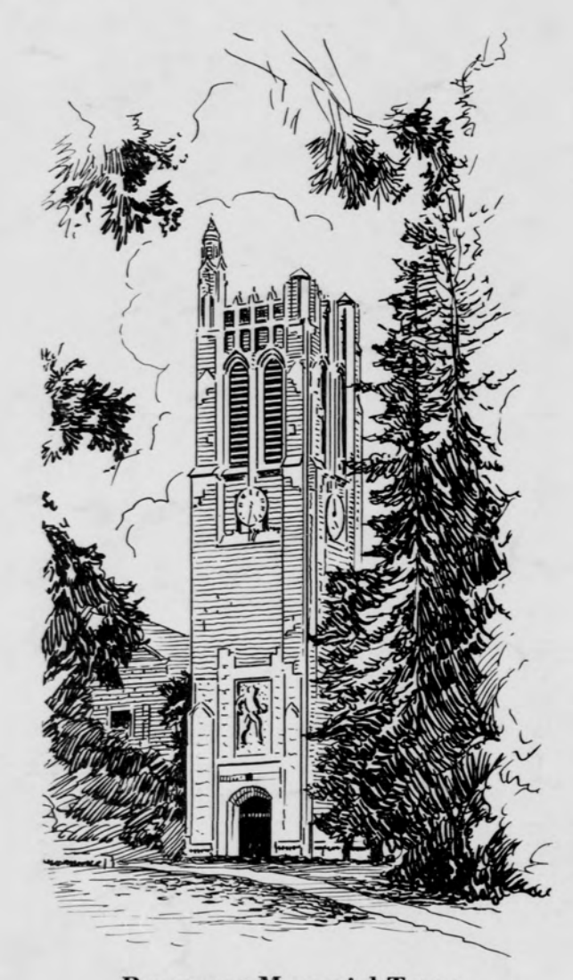
Beaumont Memorial Tower