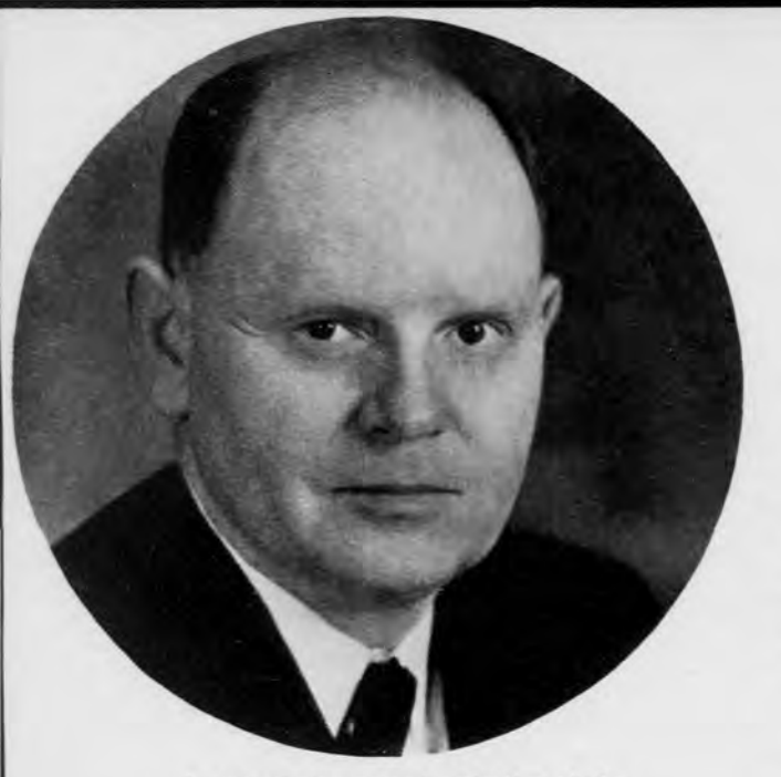
... he directs the varied activities of the Division of Agriculture.