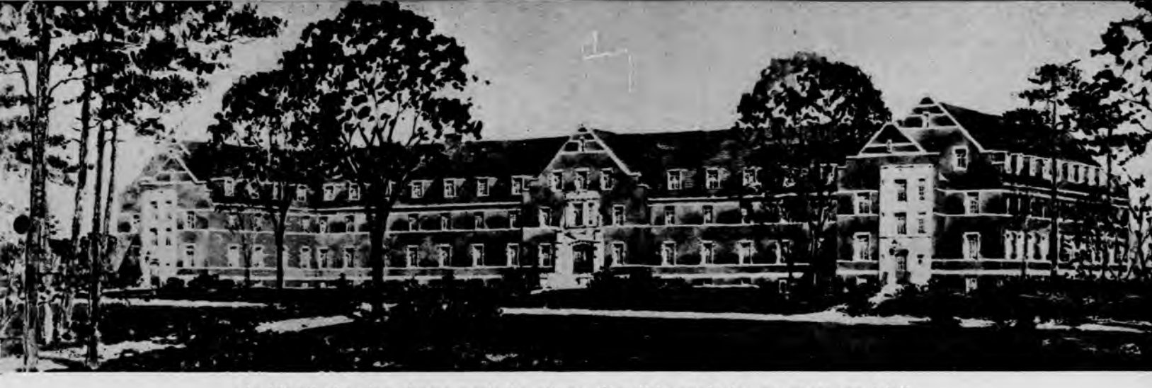
Architect's drawing of new men's dormitory. It will be ready for occupancy next fall.