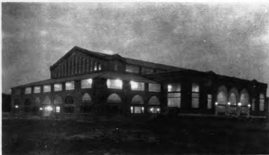
Demonstration Hall Popular Building for Winter Sports and College Programs