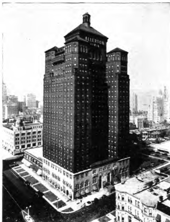
ALLERTON HOTEL, CHICAGO