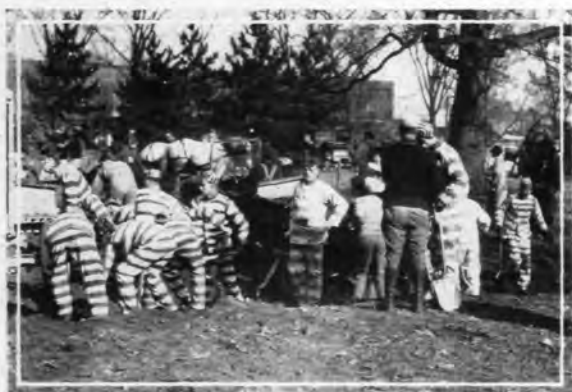
When The 'Tics Appeared as Convicts.