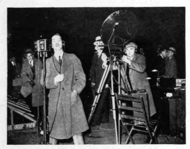
Receiving mirror on roof of General Electric Research Laboratory

Thus was "narrowcasting," a possible means of secret communication, recently demonstrated to Military and Naval experts by General Electric engineers. The future will demonstrate its commercial value. Electrical developments such as this are largely the accomplishments of college-trained engineers. They are leading the way to even greater progress in the electrical industry and are helping to maintain General Electric's leadership in this field.