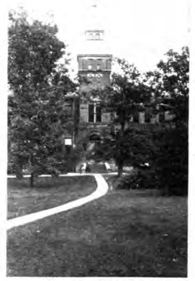
ADMINISTRATION BUILDING—high school students should be well informed on admission requirements before sending credits to the registrar.

G RADUATES of approved high schools who meet the requirements as set forth and are recommended are admitted to our four-year courses without examination. A certificate of rec-