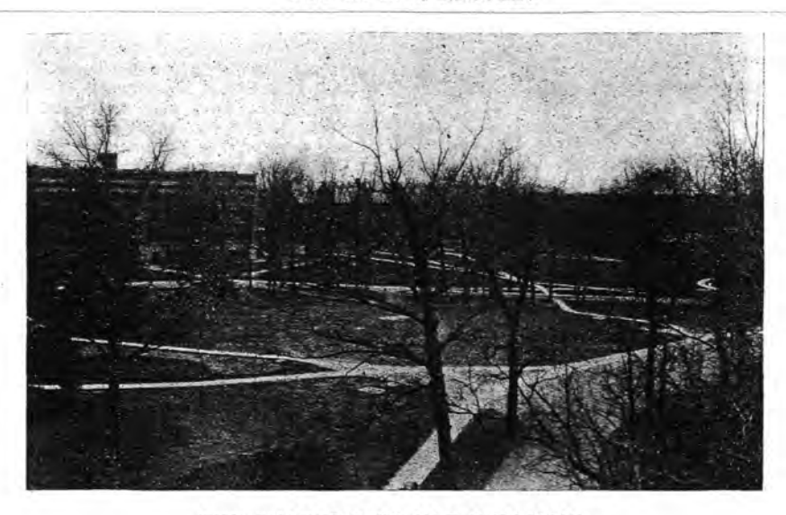
THE SHADOWS OF OLD WILLIAMS.

Only the "shades" remain. Looking across Williams Hall site toward Wells, from second story window of the Library.