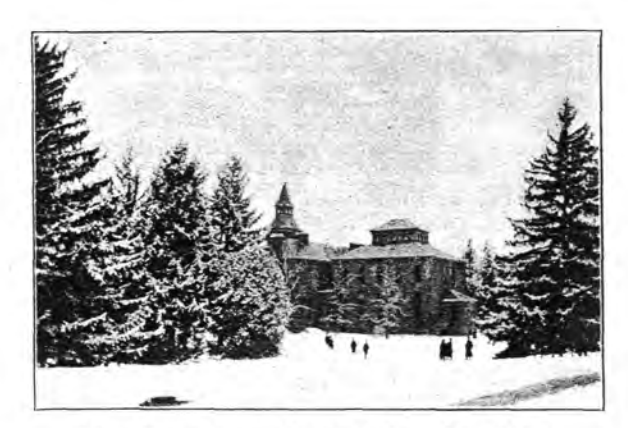
The Library from the Agricultural Building.