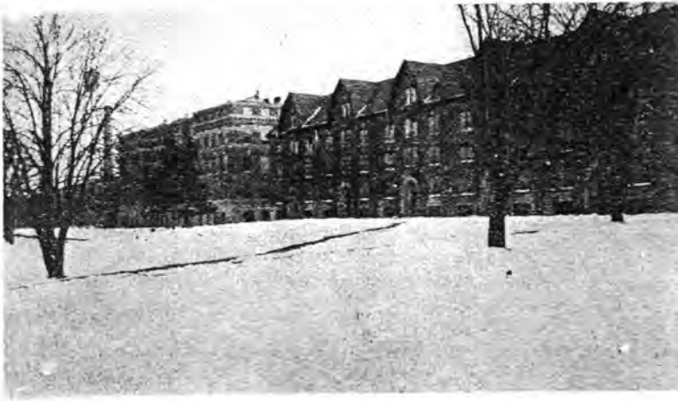
Wells Hall and R. E. Olds Hall of Engineering.