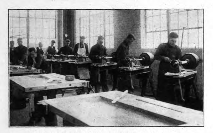
EAST END OF FIRST FLOOR, SHOP No. 1.

Showing group of direct drive motor-head lathes for wood turning. Each lathe has speeds varying from 600 to 3,000 R. P. M. In this end of the room there are also 35 wood working benches capable of accommodating a clcss of 70 at one time. The piping for a dry kiln is being installed in the other end of this room, which will make it possible to have seasoned lumber for pattern making at all times.