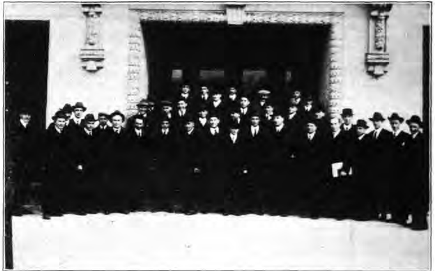
County Agents and Specialists in Conference Last Week.