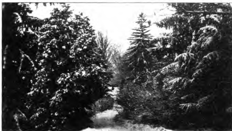
THE PATH FROM THE POSTOFFICE