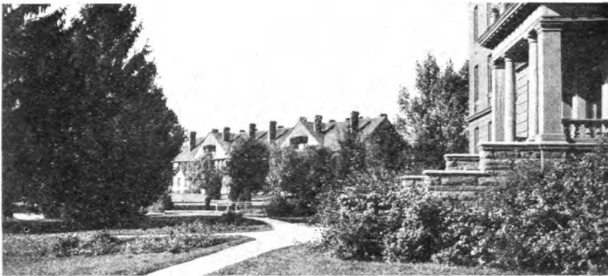
HOWARD TERRACE FROM THE WOMAN'S BUILDING.

Published by The MICHIGAN AGRICULTURAL COLLEGE ASSOCIATION East Lansing, Michigan