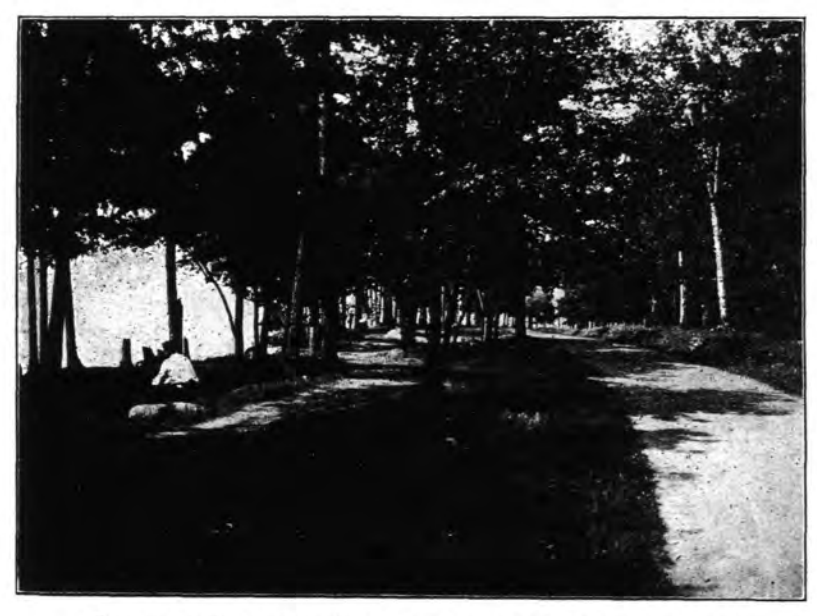
Summer Tourists to Michigan Enjoy the Shores of Old Lake Superior