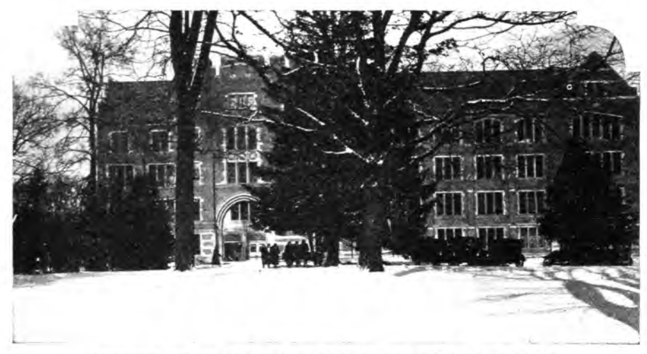
BETTER EQUIPPED TO SERVE YOU THAN LAST YEAR

Your pledge to the Building fund is due, debts on the construction costs must be paid. The Union can give the service to which it was dedicated only through your cooperation, OUTSTANDING PLEDGES ARE SUFFICIENT TO SAVE THE OFFICERS FROM EMBARASSMENT, BUT THEY MUST BE PAID IMMEDIATELY.