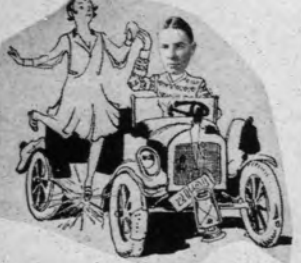
Elwood still likes the old college game.