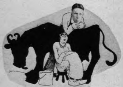
"How you gonna keep Red down on the Farm."