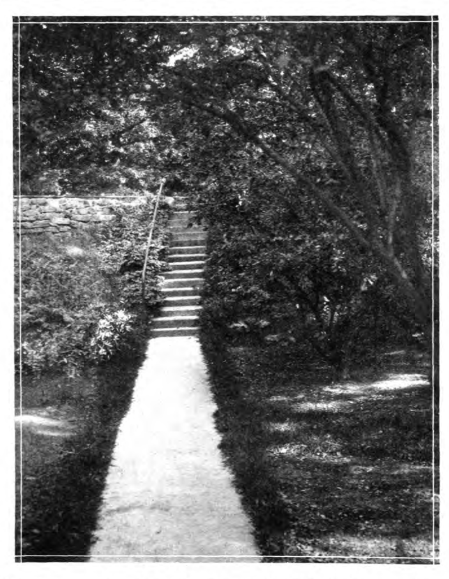
Familiar view of entrance to plot recently dedicated to memory of W. J. Beal who started the collection and through whose efforts the general place was formulated.