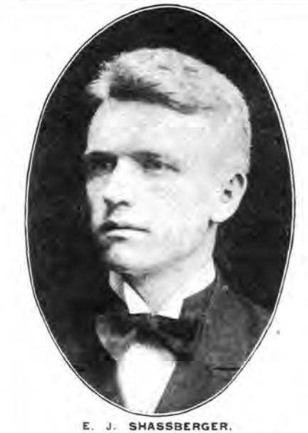
He will represent M. A. C. in the State Oratorical Contest at Hope College, March 6th.

The Hesperians gave a sweatervest party in the Armory Saturday night. The decorations represented, in a measure, college life, there being a student's room in one corner and a foot ball bleacher banked with pillows in another. Numerous penants on the wall aided in carrying out this plan. Baker's Orchestra furnished the music.