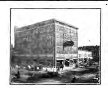
CAMERON & ARBAUGH CO.'S NEW STORE.

The man who works with one eye on the clock is likely to have plenty of time to look for another job.