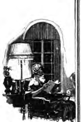
It is part of the business of electricity to make homes brighter, safer and more livable.