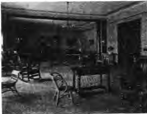
PARLORS WOMEN'S BUILDING.

The right time to do chores is when they ought to be done. When you go to the barn and find the horses stamping for their dinner and cows bawling because they are hungry, you may make up your mind that you are off your hours. The cattle know as well as you do; and every hour they are left to chafe that way takes so much out of you. Can you stand it? I can't.