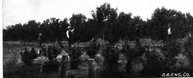
VIEWS AT THE SOUTHAVEN SUB-STATION.

ples, 2 of pears, 2 of cherries, 2 of plums, 3 of peaches and 5 of grapes, besides a miscellaneous plot containing nuts, mulberries, peaches and plums, with 57 trees in each row. Upon this land also are the small fruits, the collection including all of the new and many of the old sorts of strawberries, raspberries, blackberries, currants and gooseberries.