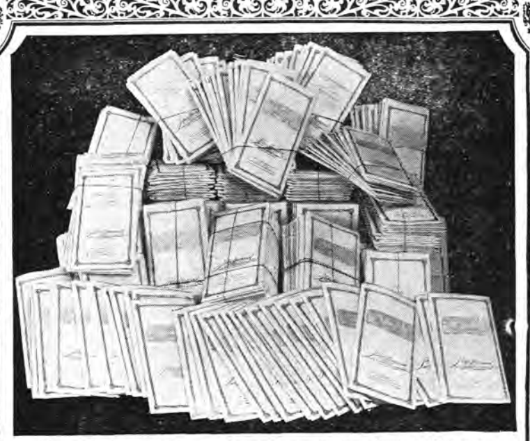
Photograph of 470 John Hancock Policies written on the lives of students of the 1923 Graduating Class of the Massachusetts Institute of Technology

THESE policies represent $125,000 in endowment insurance payable to M. I. T. at the 25th Reunion of the Class of 1923. The members are insured as individuals and pay their own premiums as a visible evidence of their loyalty to the institution.