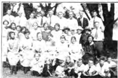
At the St. Joe County Picnic