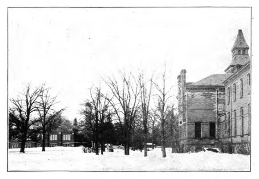
The Library up to second floor seen from south side of present Library and Administration building which is shown at the right side of the picture.