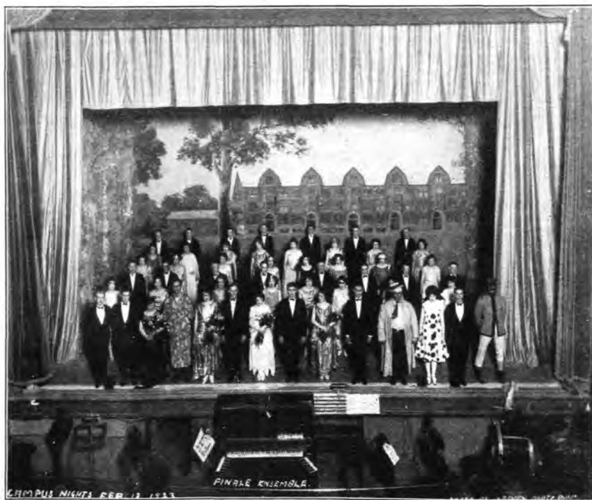
Cast and Chorus of "Campus Nights," the Union Opera