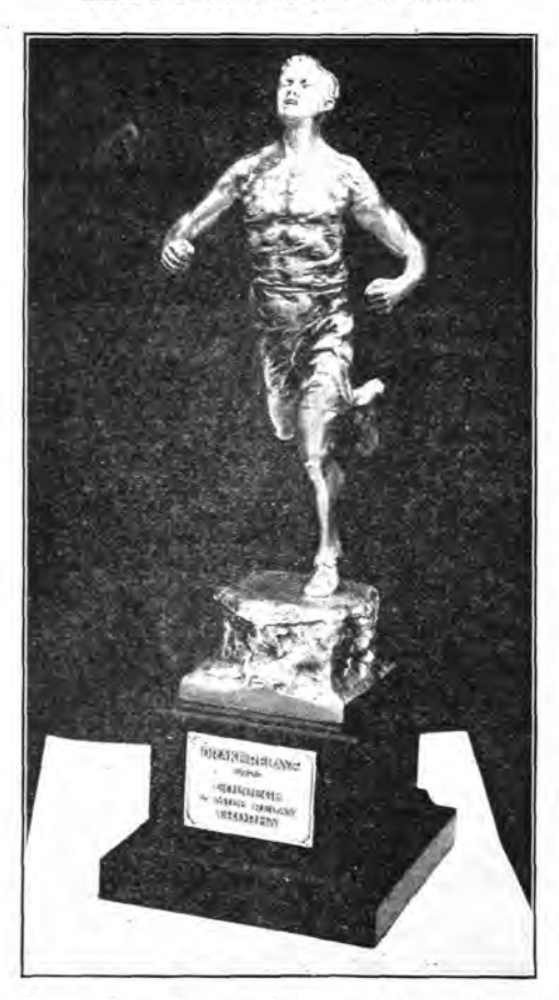
replica of the Drake relay trophy, shown above, has been presented by the M. A. C. club of Detroit to go to the winner of the state interschol-astic indoor track meet.

Finzel's orchestra of Detroit will furnish the music for the J-Hop set for the gymnasium on February 23.